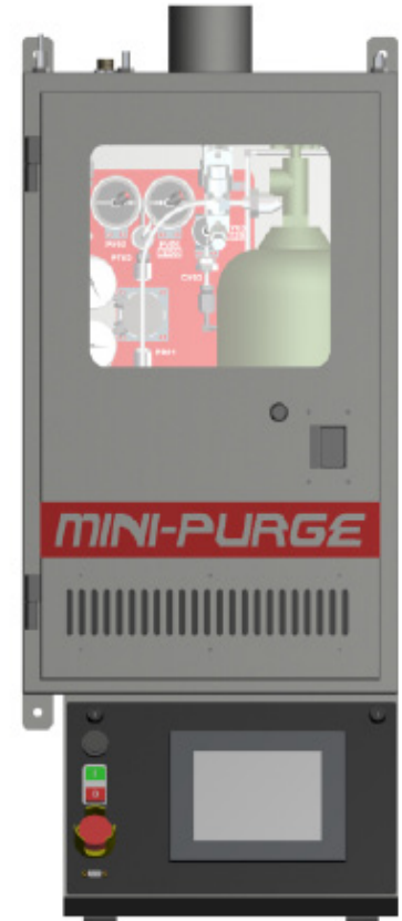
Standard 1-cyl configuration with external purge

The Ciphercon™ Mini-Purge Gas Cabinet is a re-packaged wall-mount version of the widely successful full-size 1500. This miniature fully automated gas cab boasts all of the same features, component quality, UHP construction and SAFETY of the Ciphercon™ 1500. Housing one process cylinder (up to 19"H x 8"D), the Mini utilizes time-proven PLC controlled auto-sequenced routines for all critical aspects of operations and maintenance. The bright 7.5" color touch screen intuitively guides the user through online operations, cylinder change-out, diagnostics and more.