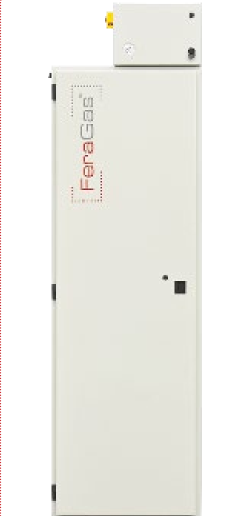
Heated, 2-cylinder enclosure

The standard FeraGas enclosure houses cylinders up to 61"H x 12"D. The controls enclosure located at the top of the gas cabinet houses the power disconnect, thermostat controls, temperature gauge and gas