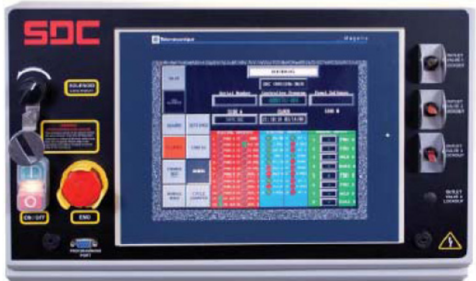
Large 10.4" color touchscreen interface