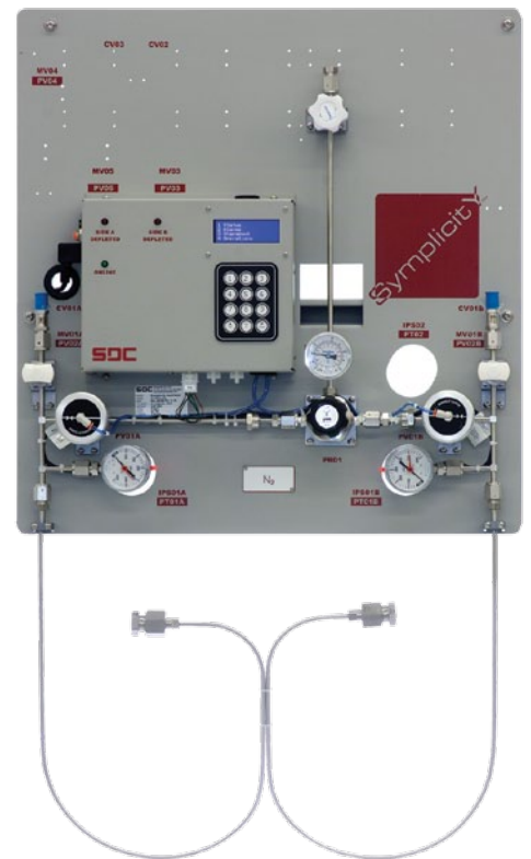
Symplcity™ with AUTO PURGE/EVAC option

The Symplcity is available in standard ¼" and HI-FLOW ½" models with a standard ten (10Ra) surface finish.