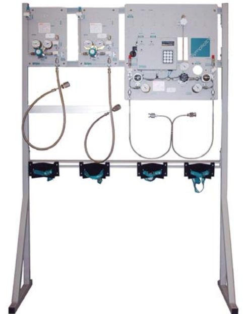
Symplicity™ UHP Auto-Switchover Panel with MicroLine™ UHP Manual Gas Panels mounted on a FastRack™.