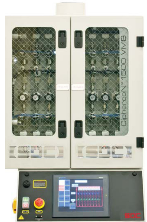
8-stick populated VMB

The CiphercoN 1500 VMB supports simple dry-contact communication for hazard alarms, process alarms, tool call, external EMO, external EGO and more. If your gas management solution requires more sophisticated communication, the 1500 VMB also supports Ethernet using open Modbus™ TCP protocol. This allows the CiphercoN